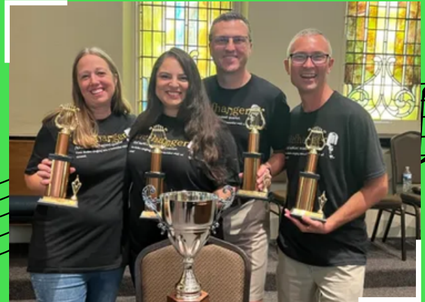
Clefhanger Mixed Quartet